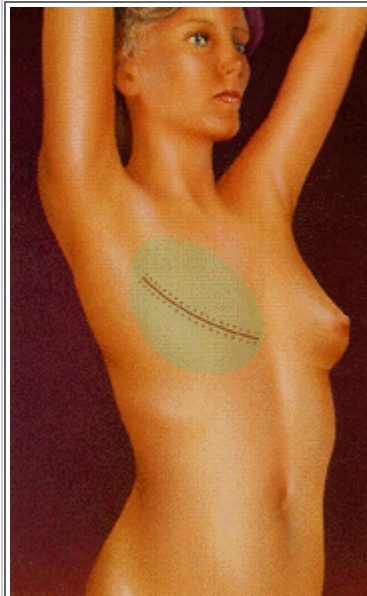
A tissue expander is inserted following the mastectomy to prepare for reconstruction.

Following mastectomy, your surgeon will insert a balloon expander beneath your skin and chest muscle. Through a tiny valve mechanism buried beneath the skin, he or she will periodically inject a salt-water solution to gradually fill the expander over several weeks or months. After the skin over the breast area has stretched enough, the expander may be removed in a second operation and a more permanent implant will be inserted. Some expanders are designed to be left in place as the final implant. The nipple and the dark skin surrounding it, called the areola, are reconstructed in a subsequent procedure.