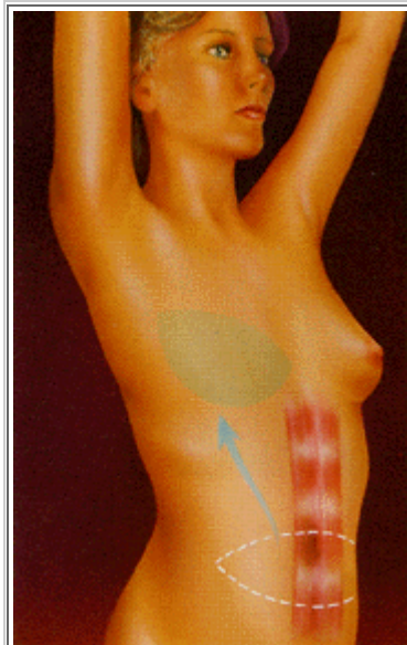
Tissue may be taken from the abdomen and tunneled to the breast or surgically transplanted to form a new breast mound.

Regardless of whether the tissue is tunneled beneath the skin on a pedicle or transplanted to the chest as a microvascular flap, this type of surgery is more complex than skin expansion. Scars will be left at both the tissue donor site and at the reconstructed breast, and recovery will take longer than with an implant. On the other hand, when the breast is reconstructed entirely with your own tissue, the results are generally more natural and there are no concerns about a silicone implant. In some cases, you may have the added benefit of an improved abdominal contour.