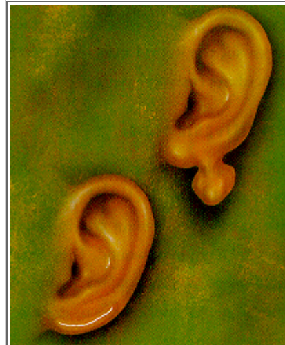
This thick, over-grown cluster of scar tissue on the earlobe is a keloid. Here it has been removed and the incision closed with stitches, leaving a thin scar.