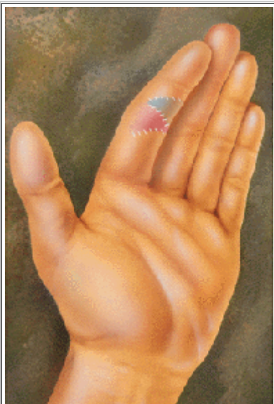
The incision is closed with a Z-shaped line of sutures. The new scar is thinner and less visible, and allows the finger to be extended.

Burns or other injuries resulting in the loss of a large area of skin may form a scar that pulls the edges of the skin together, a process called contraction. The resulting contracture may affect the adjacent muscles and tendons, restricting normal movement.